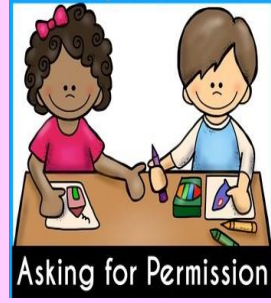
Asking for Permission

There is NO SCHOOL on Election Day, Tuesday, May 3 rd !